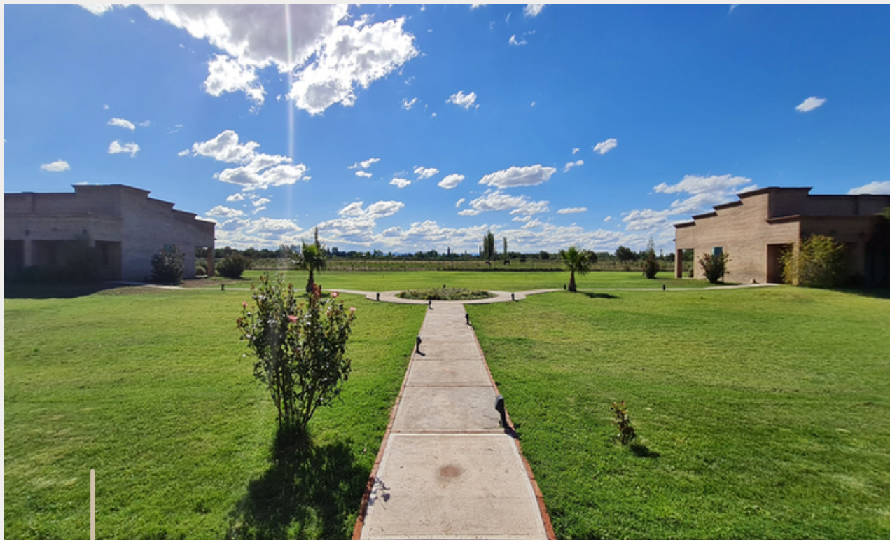
The extensive gardens are the ideal complement for relaxation and the enjoyment of nature.