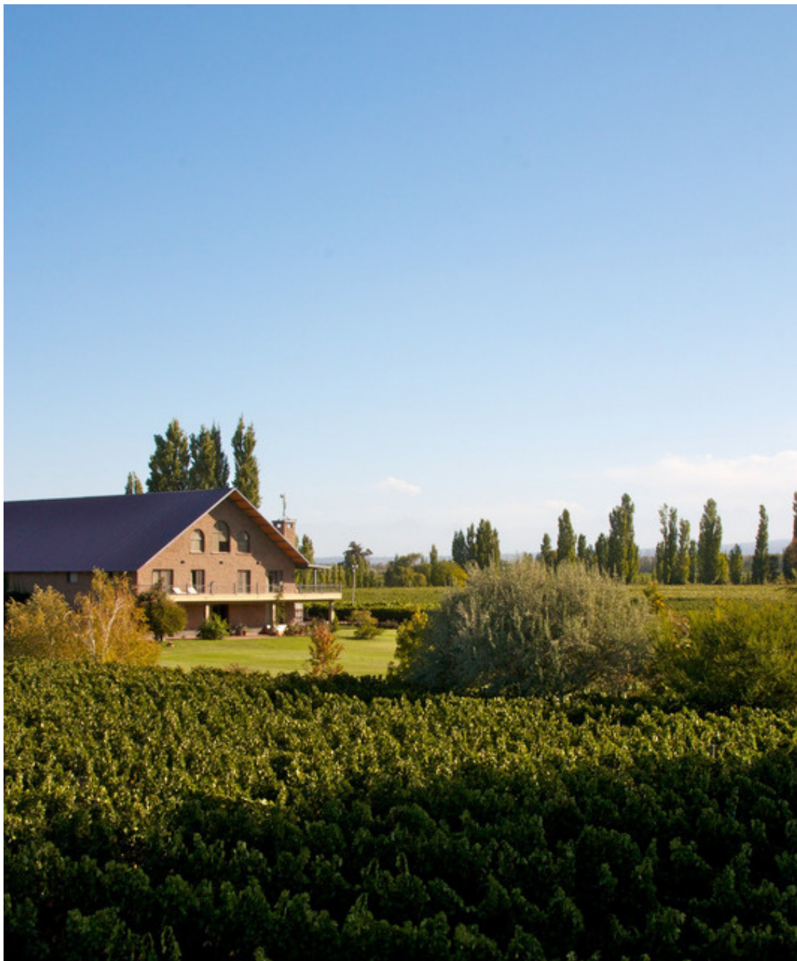
Auberge Du Vin - Tribute Portfolio, Valle de Uco, Mendoza