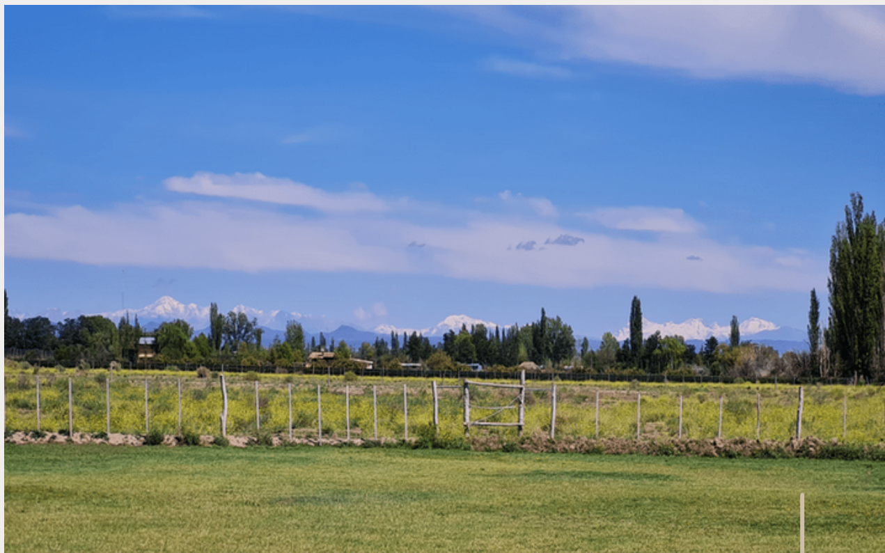
The farm landscape is impressed by the Andes mountain range.