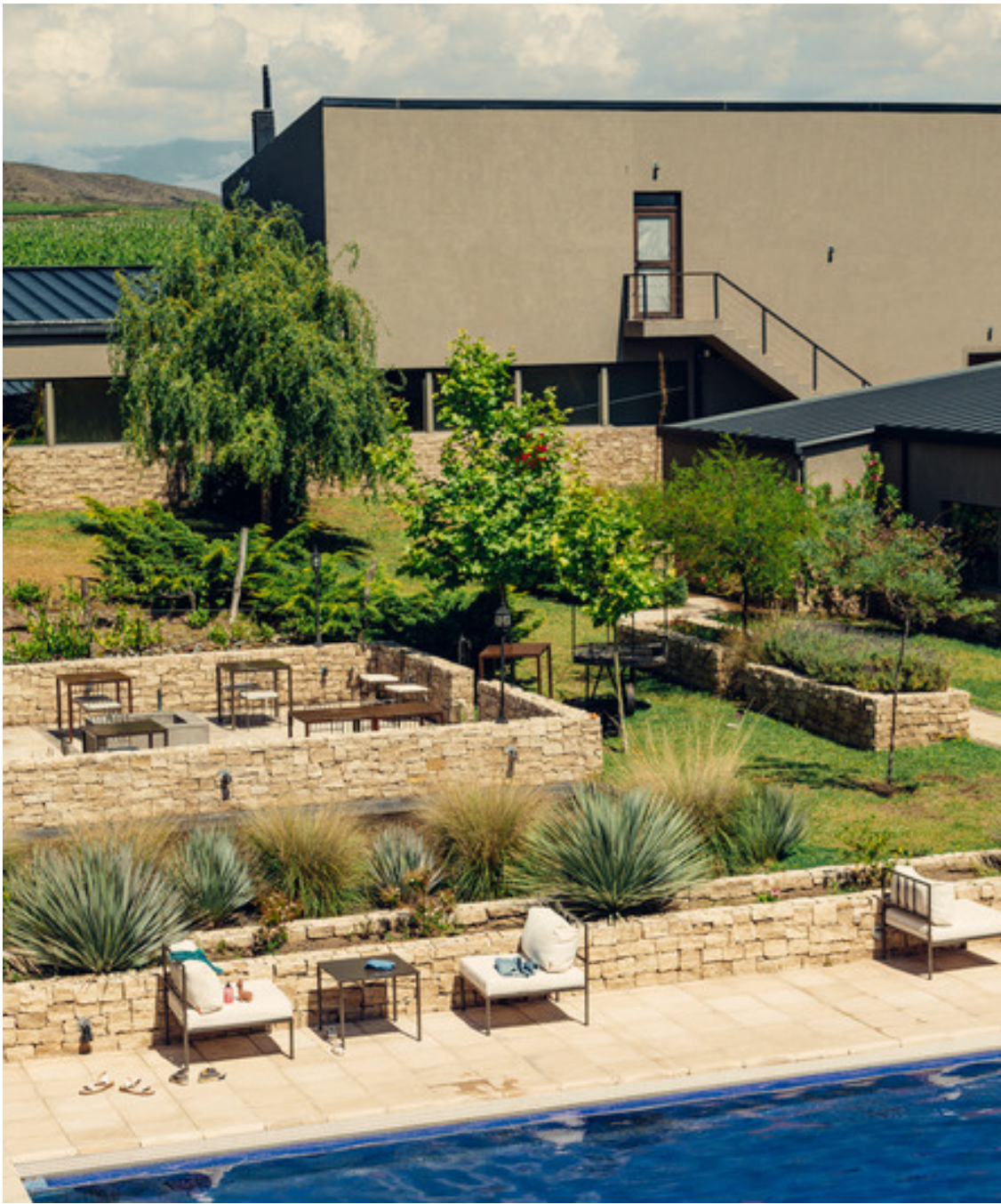
Auberge Du Vin - Tribute Portfolio, Valle de Uco, Mendoza