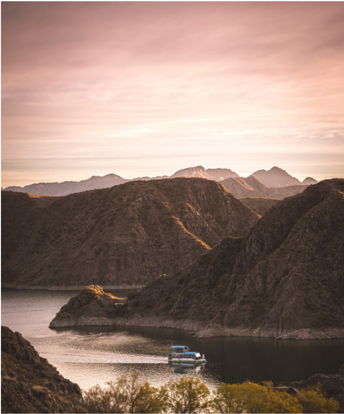
San Rafael, Mendoza